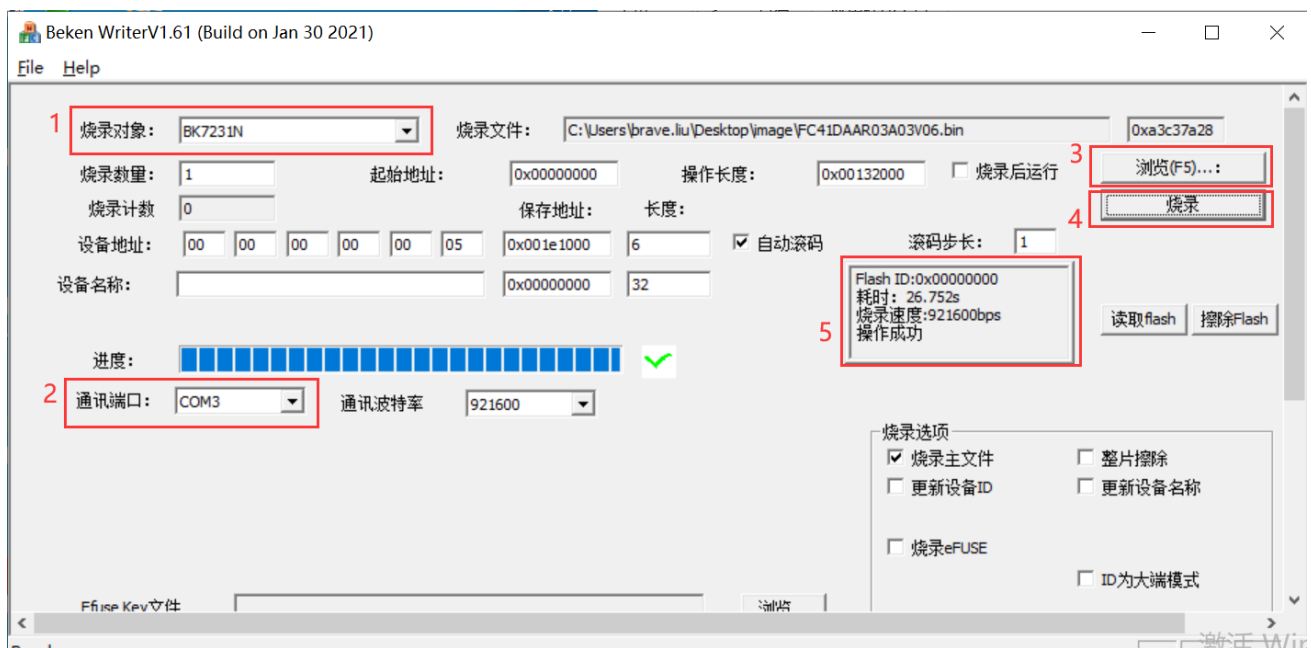
Figure 3: Flash Tool

After building FreeRTOS demo and get the image successfully, open the flash tool projects\beken\tools\bk_writer_v6.13.exe .