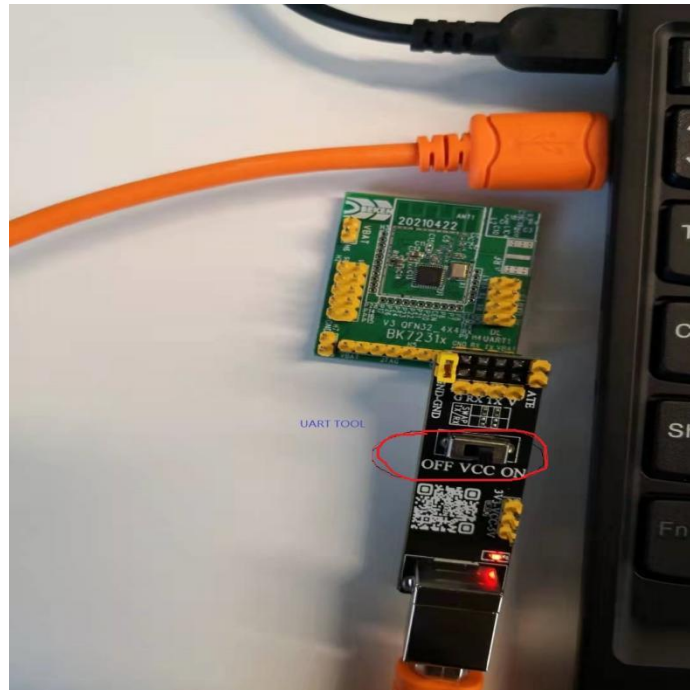
Figure 2: Establish a Serial Connection