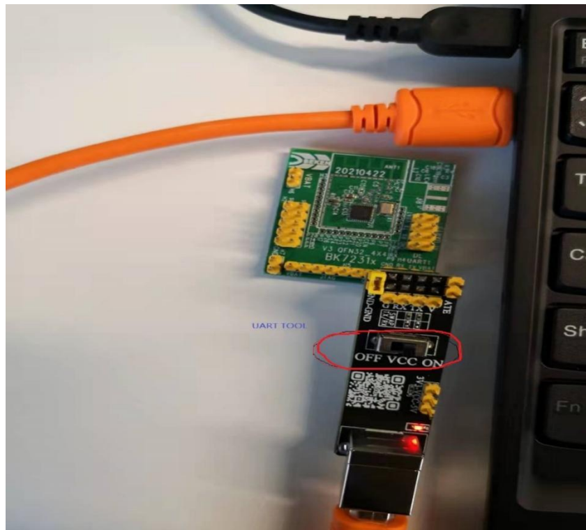
Figure 4: Switch VCC to ON

When connecting the demo board with computer via serial tool, switch VCC to ON.